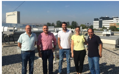
The UGR researchers who participated in this project.