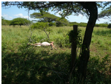
Antelope and camouflaged camera-trap