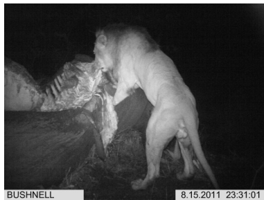
Lion eating elephant