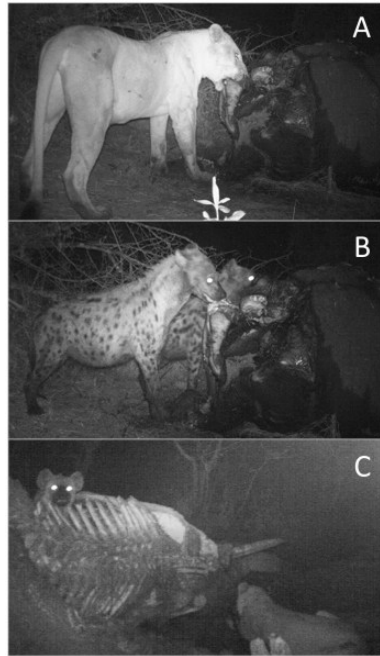
Lions and hyenas sharing carrion