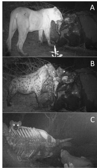
Lions and hyaenas sharing carrion