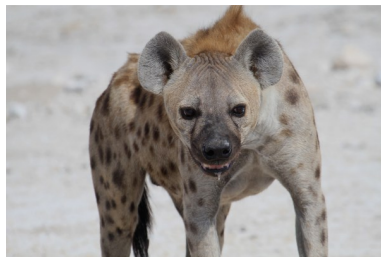
Spotted hyaena ( Crocota crocuta )

Amorós et al. (2020), ‘Hyaenas and lions: How the largest African carnivores interact at carcasses.’ Oikos . Online: Doi: 10.1111/oik.06846