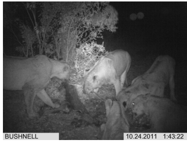
Lions eating antelope