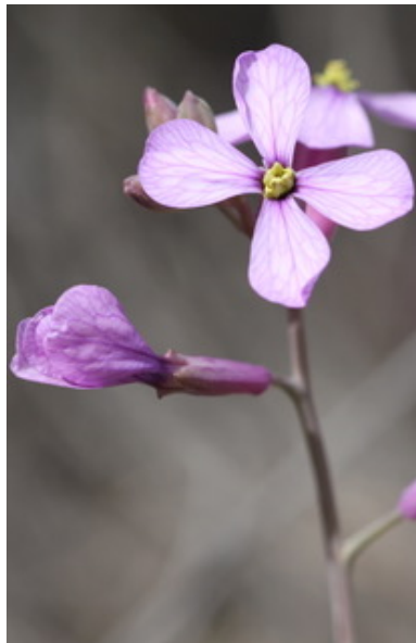
The springtime flower