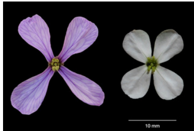
The flower produced by Moricandia arvensis in Spring vs. in Summer