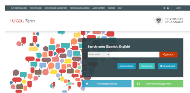
The UGRTerm interface ( https://ugrterm.ugr.es/ )

UGRTerm, the Spanish-English language resource that was officially launched in March 2018, contains the official nomenclature of the University of Granada (UGR) and a considerable number of terms and expressions related to research and higher education. It also features terminology from cross-cutting spheres such as the social sciences and humanities; law; economics and statistics; information, communication and public events; public infrastructure; and politics, government and administration. The resource now contains over 40,000 terms in English and Spanish.