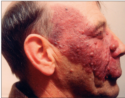
Fig. 2 A patient with Sturge Weber Syndrome

A systematic approach is needed for examining the Cranial Nerves. One approach is to consider