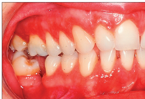
Fig. 2 This young female patient presented with gingivitis but had good oral hygiene. The gingival swelling was later found to be due to sarcoid

ma nodosum. Erythema nodosum comprises painful, erythematous nodular lesions on the anterior shins, but are not specific for sarcoid, for example they may also be seen in TB. Extra-thoracic manifestations of sarcoidosis are listed in Table 2. Gingival swelling found to be due to sarcoid is shown in Figure 2. The mainstay of diagnosis is a rise in the Serum Angiotensin Converting Enzyme level. Treatment may be carried out using steroids which may have implications for dental treatment as well as potential respiratory impairment.