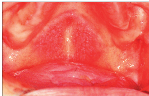
Fig. 3 This patient was using inhaled corticosteroids for the treatment of COAD and has developed candidosis as a result. The full upper denture baseplate has protected the palate more anteriorly

antimuscarinic agents often will have a dry mouth. More uncommon oral findings on examination may be a hyperpigmentation of the soft palate in lung cancer, or even bony metastases from lung cancer in the jaws. Chronic ulcers of the dorsum of tongue may rarely be an oral manifestation of TB. Cervical lymphadenopathy from TB may also be evident, but the more common lymphadenopathy secondary to a URTI should be considered first, (Table 3).