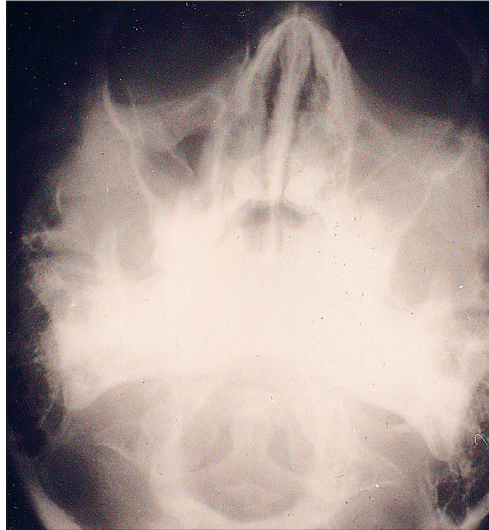
Fig. 1 Increased radiopacity of the left maxillary antrum in maxillary sinusitis