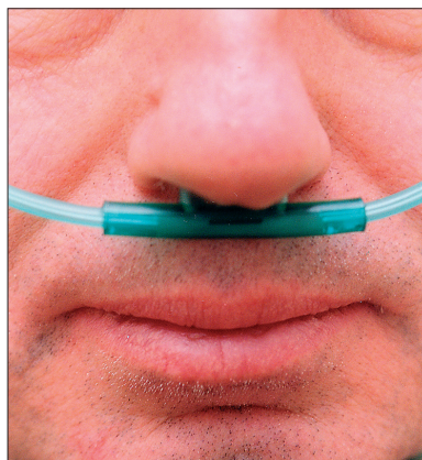
Fig. 5 Supplemental oxygen administered via nasal cannula

Asthmatic patients should have treatment carried out using LA if possible. Effort should be made to allay anxiety as far as possible and treatment should not be carried out if the patient