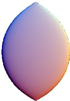
FIGURE 2. A rotational peaked sphere ( K = 1 ) in \mathbb{R}^3

In Section 5 we turn our attention to the study of the constant curvature equation (1.3). More generally, we will deal there with some basic facts about surfaces of constant positive curvature K > 0 in \mathbb{R}^3 . We will explain how these surfaces also have an associated conformal structure, and a holomorphic quadratic differential. Also, we will show that the Gauss map is a harmonic map into \mathbb{S}^2 for this conformal structure, and we will provide some representation formulas.