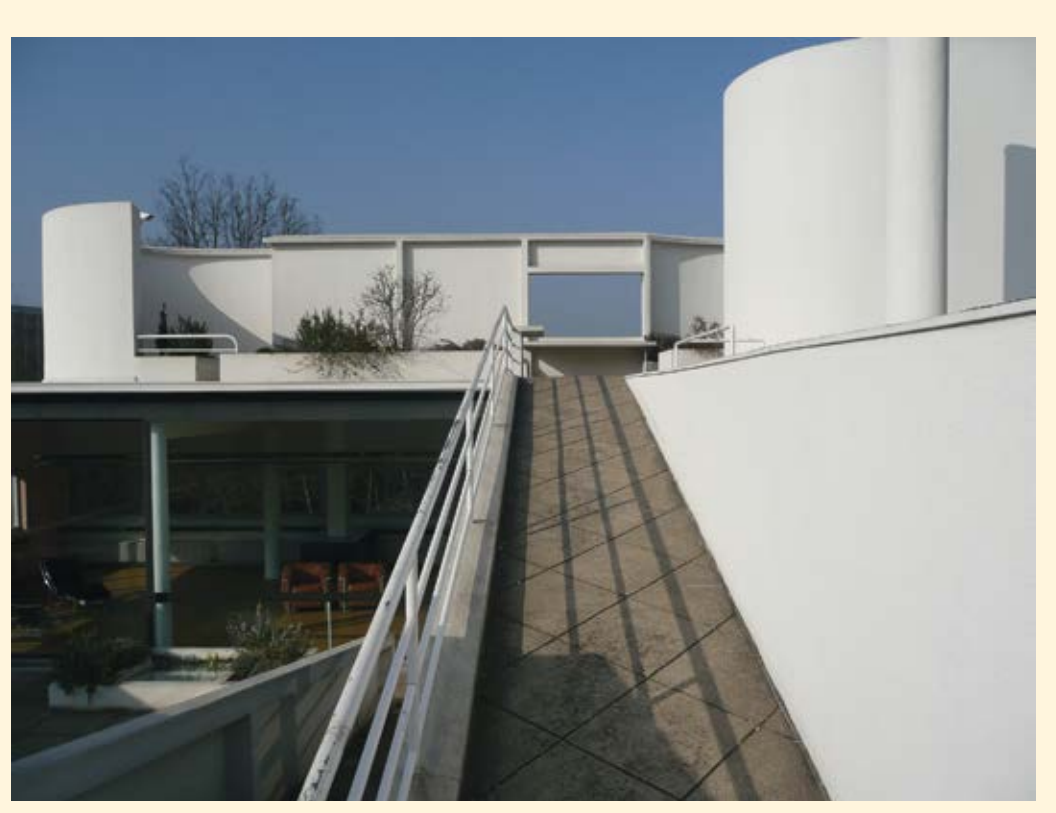
6a,b / Le Corbusier: Villa Savoye. Poissy. 1929.