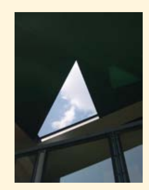
6g/ Le Corbusier: Opening in the roof in La Maison de l'Homme . Zürich. 1960–1967.

spectators who penetrated into this den, which was hyper technological, natural and tellurian all at the same time, would be met with an astonishing display of oversized images projected on the walls, playing out the main themes behind Le Corbusier's world view in a dramatic, captivating way. The entire inside of this real stomach/ space, which was designed to 'digest' and transform the conformist spirit, forced the visitor, who was perhaps absorbed in the multisensory experience of Le Corbusier and Varès' Le Poème électronique, to move about, abandoning the tranquillity of the usual stationary position assumed for cinema.