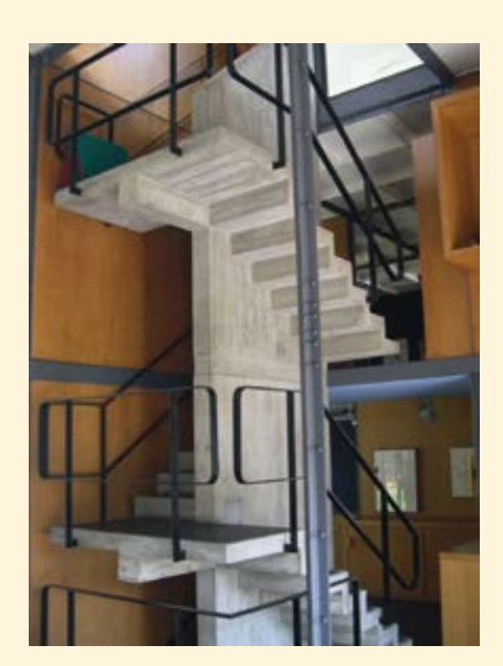
6e/ Le Corbusier: Stair in La Maison de l'Homme. Zürich. 1960–1967.

kind of promenade, one which passed between the ancient history of mankind and its latest technological developments<sup>8</sup>. [6d] With the unity of architecture, film and music by Le Corbusier, Iannis Xenakis and Edgar Varèse, the Philips Pavilion represents Le Corbusier's 50-year aspiration to achieve synthesis between the arts and the human senses. Despite the use of advanced construction techniques, the shape of the pavilion resembled the form of a nomad tent, recalling the architecture of travel (this concept of a modern form of nomadism led Le Corbusier to call his tapestries 'muralnomads'). This modern 'tent' housed a 'promenade' which provided a total, sensory experience: