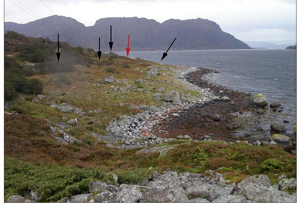
Figure 5. The black arrows indicate the burials and the red arrow indicates a rock art panel.