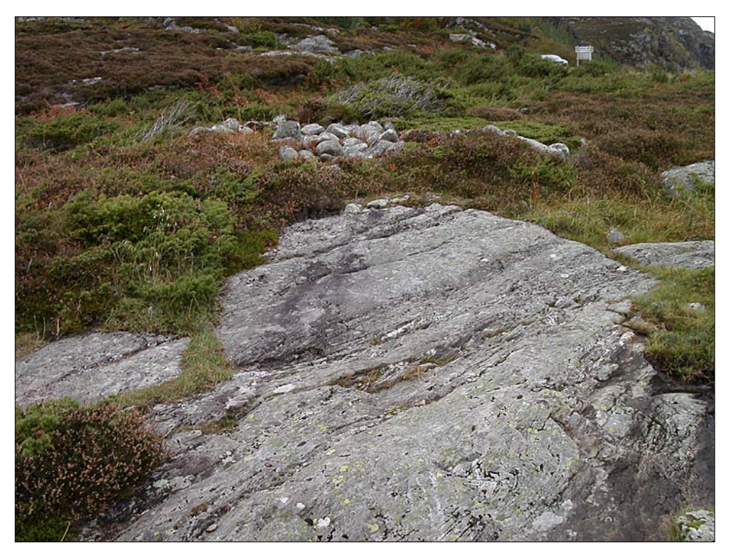
Figure 3. A burial, visible as a small collection of stones, is located above a rock art panel

of which only one could be dated to the Bronze Age; none were located near rock art panels. A flint dagger and a stone axe have been found in contexts that indicate burials, from the Early Bronze Age and the Late Bronze Age respectively. The cairns are generally located at 5-20 m.a.s.l., near the sea or in places where there is a good view of the sea and surrounding landscape.