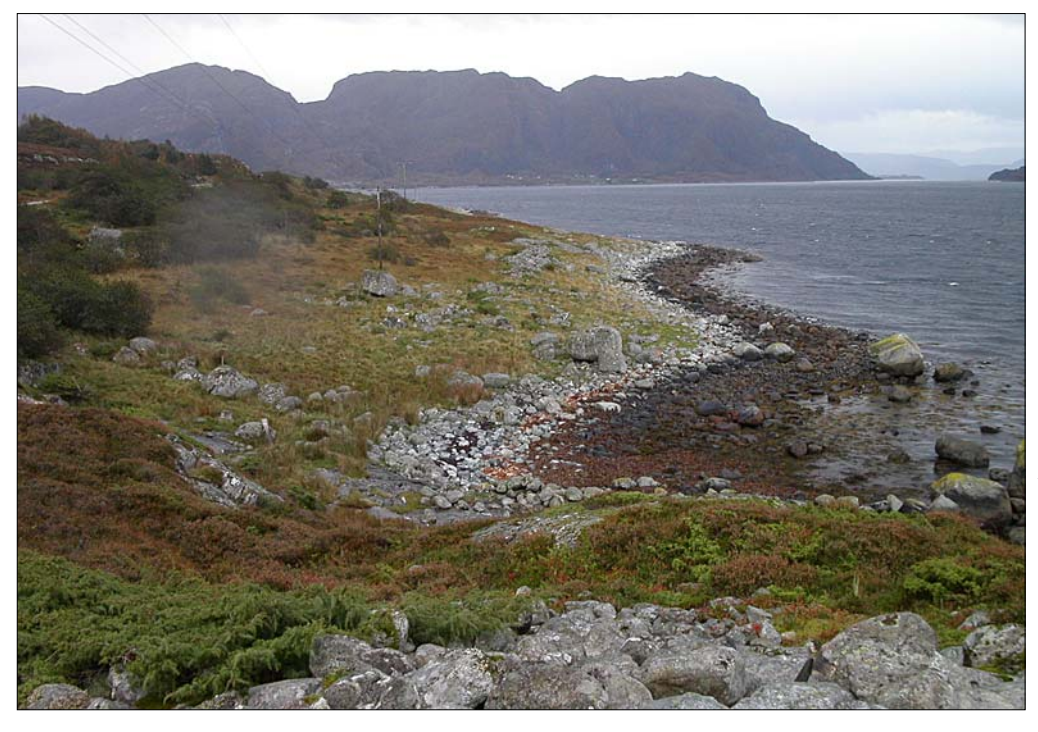
Figure 4. A typical landscape room, the edge is formed by a rock art site. Note how difficult it is to see the monuments in this area.

between the cairns as well; it is generally possible to see at least one monument – a cairn, a rock art panel or both, as well as places where other monuments are located – from every cairn. My interpretation is that they are public and were intended to be seen; there is at least a visual relationship between the two types of monument. The cairns address the sea and the shipping lane, in some cases having a panoramic view of the coast. However, unless one sails quite close to the shore, the cairns are difficult to spot from the sea as they blend into the rocky terrain. This is especially the case at Unneset, where the cairns can be hard to see even from the shore ( fig 4 and 5 ). The view from the cairns thus appears to have been more important than the view from the sea, i.e. from the superior landscape room.