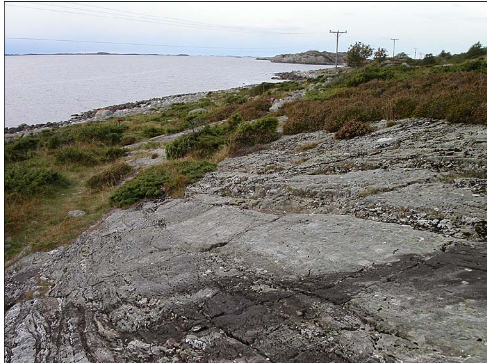
Figure 2. The landscape, a rock art panel is in the foreground

The rock art panels are located between 4 and 6 m.a.s.l. and are all found on outcrops in the shore area ( fig 2 ). One panel is found in a secondary position at 15 m.a.s.l. There is no reliable shoreline data available for this area; however, I used a computer programme developed at the University of Tromsø, Norway<sup>1</sup> to give an estimate of the shoreline in the area, indicating a difference of about 5